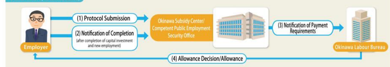
Flow chart(1,2 shared above)

* Planning documents concerning the establishment, maintenance and hiring of business establishments (building and facilities at business site).